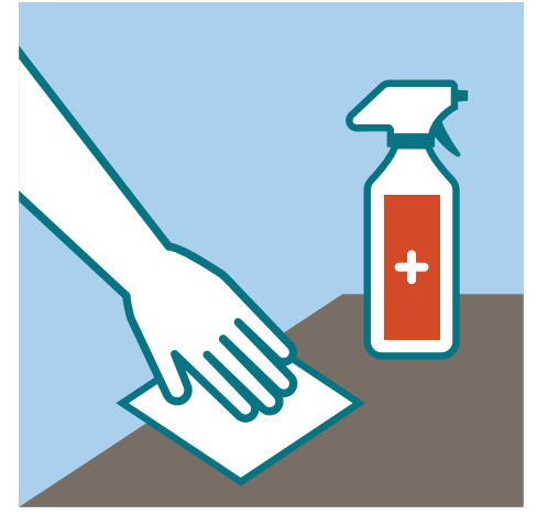
Clean and disinfect frequently touched objects and surfaces