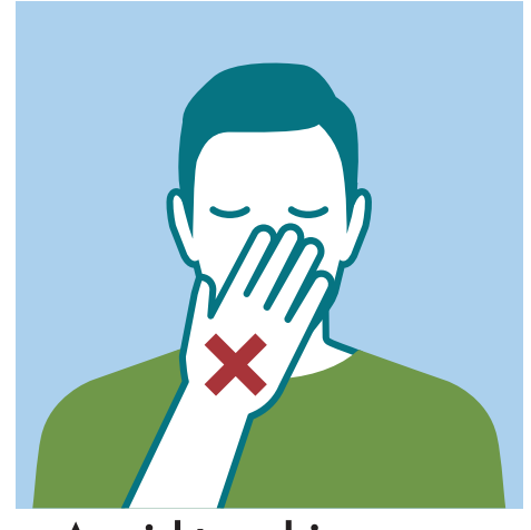
Avoid touching your eyes, nose and mouth, especially with unwashed hands