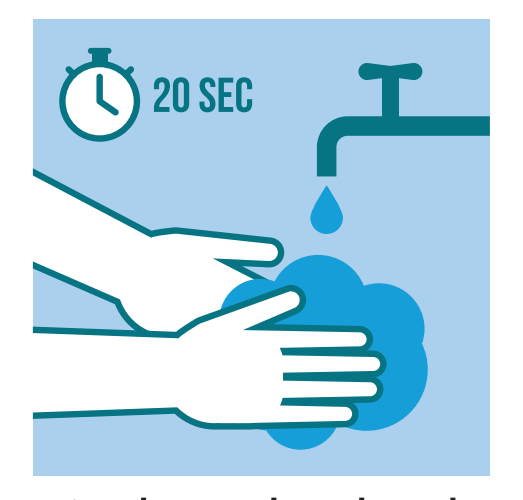
Wash your hands with soap and water or alcohol-based hand sanitizer for at least 20 seconds