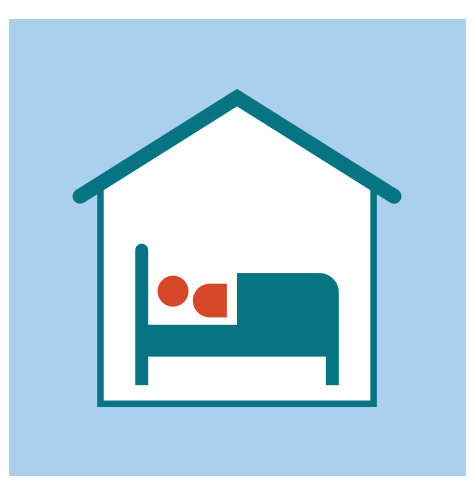
Stay at home if you are sick, except to get medical care